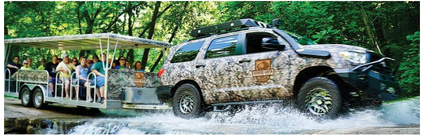
Dogwood Canyon Tram Tour