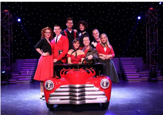
Hot Rods & High Heels