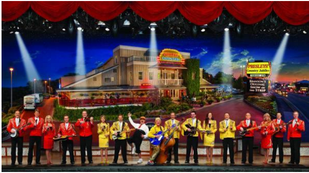
Presleys' Country Jubilee