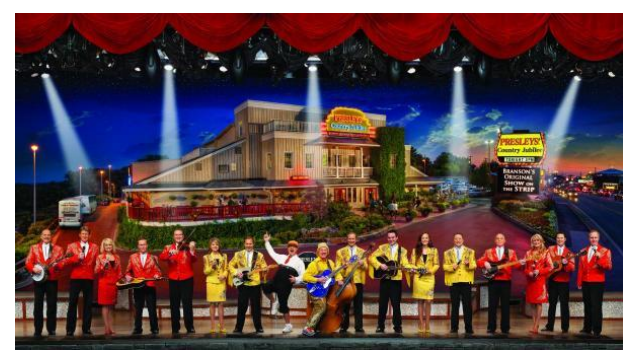
Presleys' Country Jubilee