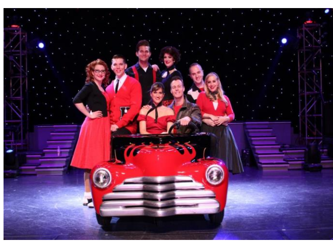
Hot Rods & High Heels