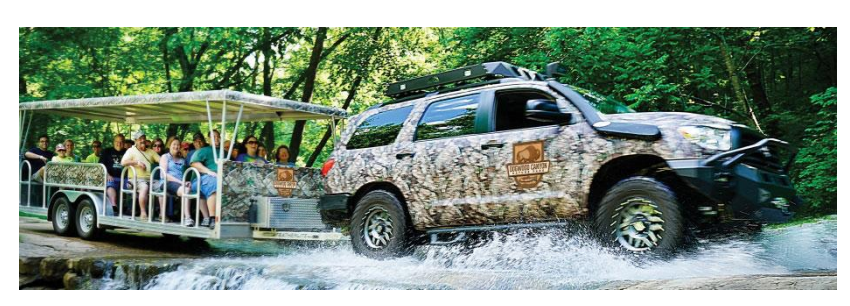
Dogwood Canyon Tram Tour