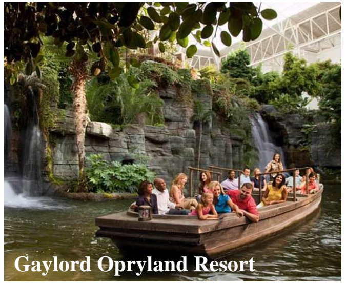
Gaylord Opryland Resort