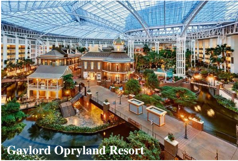
Gaylord Opryland Resort