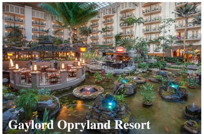
Gaylord Opryland Resort